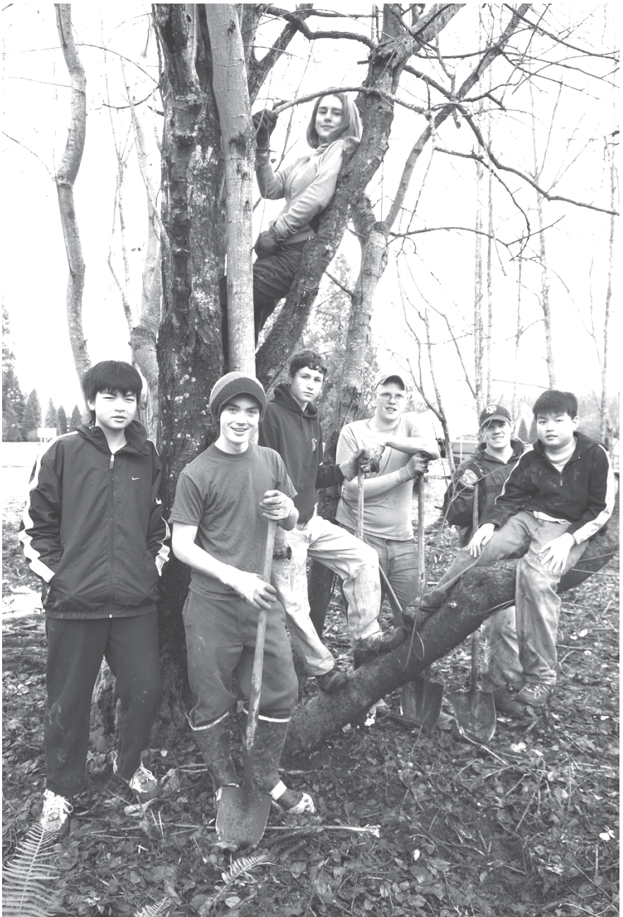
21 Acres, volunteer student work crew on the job.