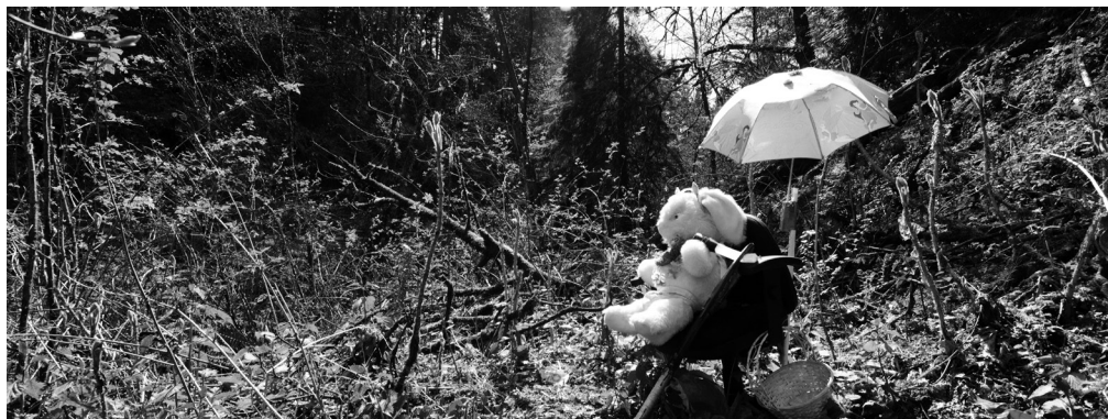
Littering? The "Hollywood Hill Watch Bunny" knows....beware!