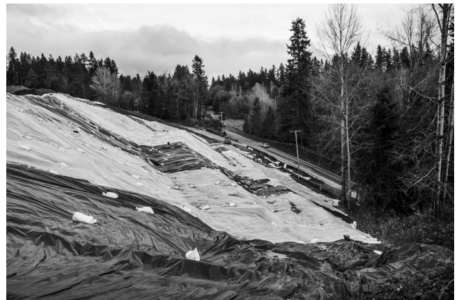
Residents are concerned about the safety of this landfill which looms over 152nd PL NE across from the Saddle Club. According to the contractor, post-project landscaping will consist of spreading grass seeds.

For those of you who have been here longer, you know that 2013 has been a relatively quiet year for our issues. But issues can pop up suddenly and it is key that we address them appropriately. Once the shovels get busy, it is usually too late to influence the policy that underlies the permit - the landfill operation above the Saddle Club arena being just one example. We want to support good policy and improve or defeat poor policy before it is enacted, which means getting involved early. Having our community aware and involved is key to our success in protecting and enhancing this special place in which we are fortunate to live.