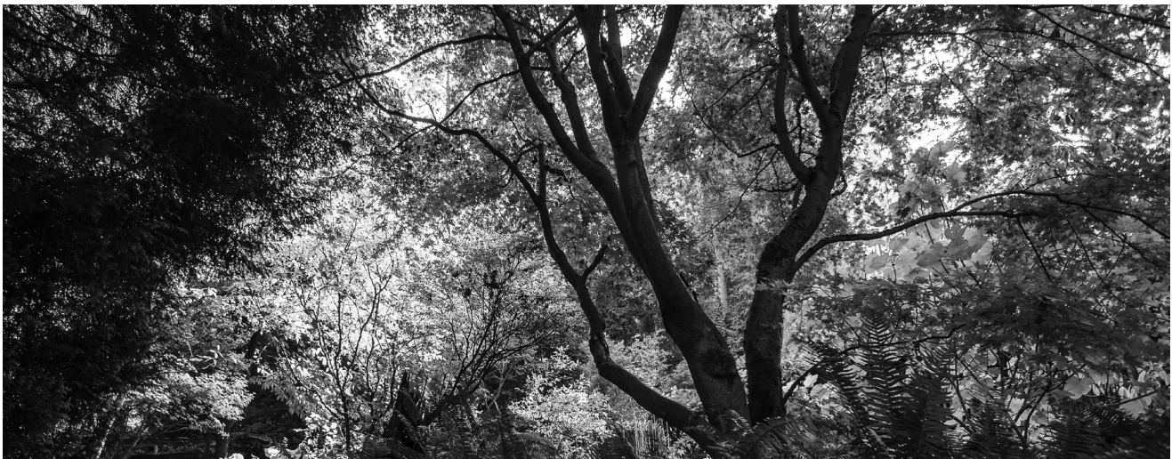
Fall Colors in Black and White.